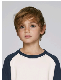
Mini Scouts Contrast